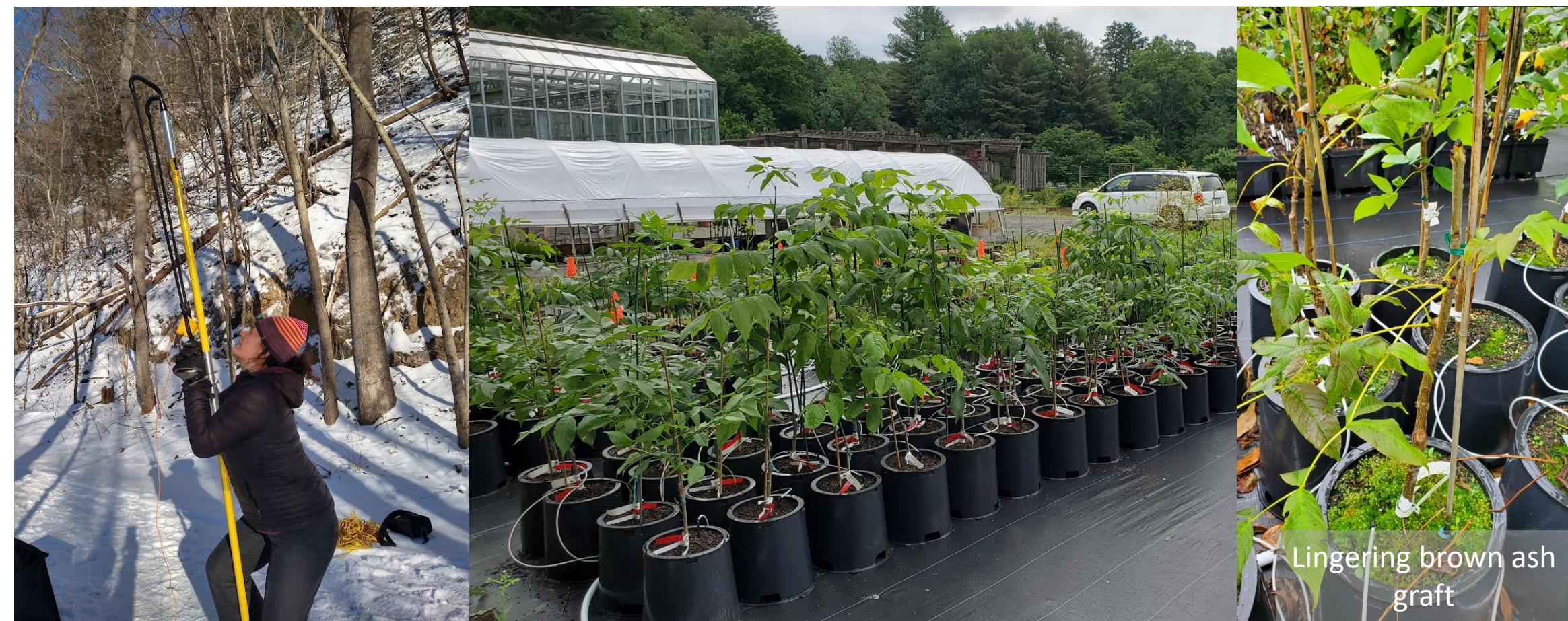
Scion collection from a lingering tree (left), clone bank from lingering ash, Cornell Botanic Gardens 5 months after grafting (middle and right)

Selective breeding has not yet been performed using trees grafted from brown ash. However, scion collected from multiple lingering brown along with white and green ash by the Monitoring and Managing Ash (MaMA) program in New York have been used to create a clone bank, which can be used for selective breeding. As MaMA’s efforts to find lingering brown ash expand throughout the Northeast, the number of lingering brown ash from which scion can be collected will likely increase considerably.