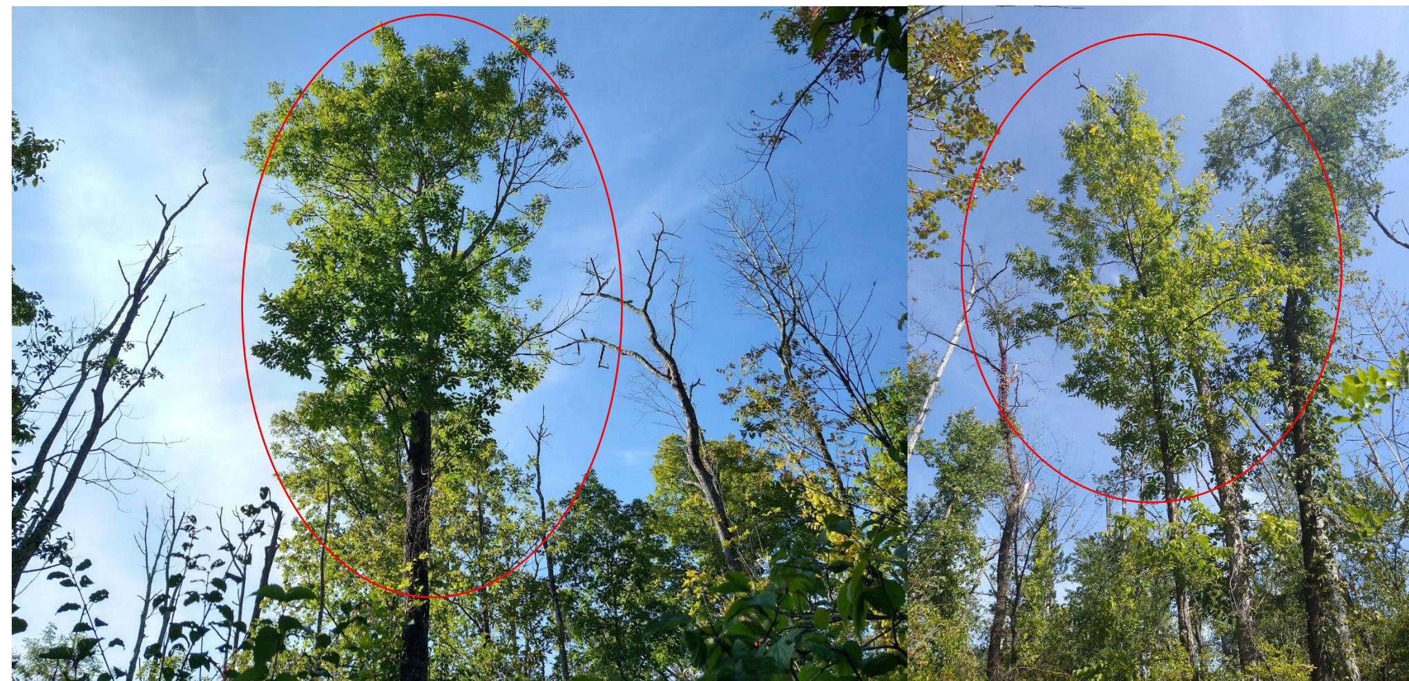
Lingering white ash (left) and brown ash (right) found in Hudson Valley, surrounded by dead ash; photo by R. Wildova.

Lingering (“resilient”) ash are chemically untreated mature ( \geq 4 ” dbh) trees that retain healthy crowns through peak EAB invasion. They are not trees that merely survive peak invasion nor are they trees that reached maturity after the onset of peak infestation (ingrowth in the aftermath of peak EAB). Lingering ash have been found for all three widespread Northeastern species: white ( Fraxinus americana ), green ( F. pennsylvanica ), and brown ( F. nigra ). Although lingering ash display some resistance, it often is not complete, meaning that even these trees will likely eventually decline. Thus, lingering ash must be found once ash mortality is high enough to reveal them, but not too long afterwards.