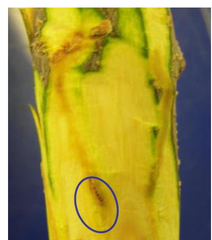
EAB larva killed by lingering ash; photo by J. Koch.

The USFS EAB Resistance Breeding Project has shown that for green ash, scion (twigs) collected from lingering trees can be grafted to yield replicates that can be used for selective breeding, yielding highly resistant trees. Thus, one role for lingering ash is furnishing scion for resistance breeding.